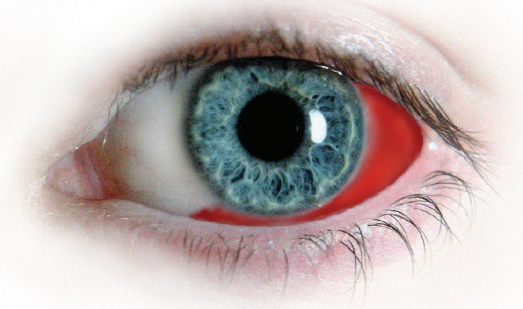
Eye with Subconjunctival Hemorrhage (SCH)

appears to the patient as if "the eye is bleeding." SCH is common, occurs more frequently in patients taking aspirin, baby aspirin, fish oil, or any other blood thinning medications. SCH is also quite common in patients receiving regular injections of medication into the eye for macular degeneration, retinal vein occlusion, or diabetic retinopathy. SCH is a harmless condition, usually resolves within one to two weeks, and requires no t reatment at all.